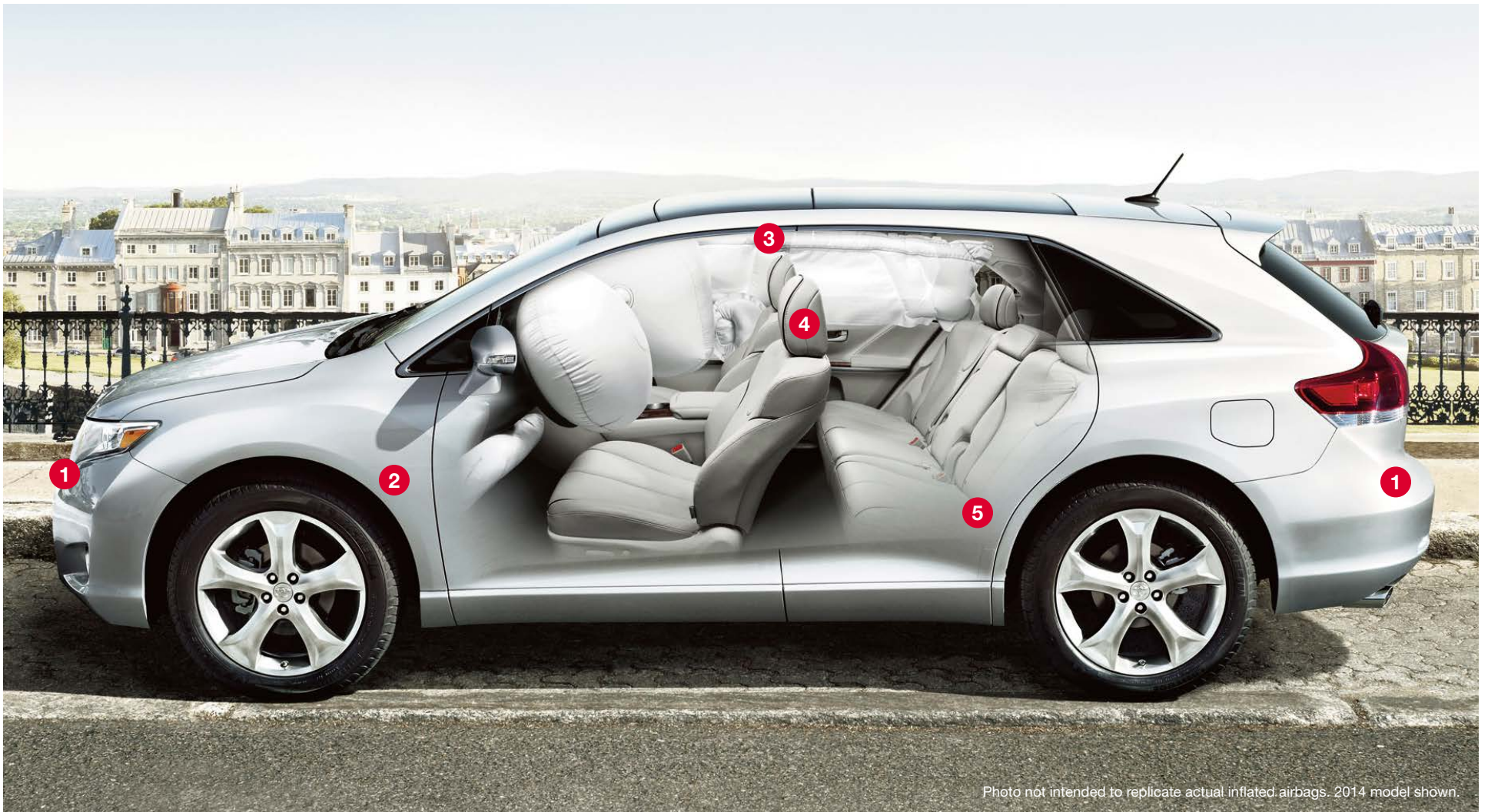
Photo not intended to replicate actual inflated airbags. 2014 model shown.

Helping to protect the smaller members of your family, LATCH (Lower Anchors and Tethers for CHildren) includes anchors and tethers on each outboard rear seat.