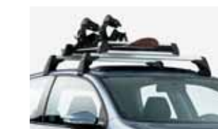
Base Carrier Bars with Ski and Snowboard Rack