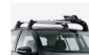
Base Carrier Bars with Barracuda® Bike Holder