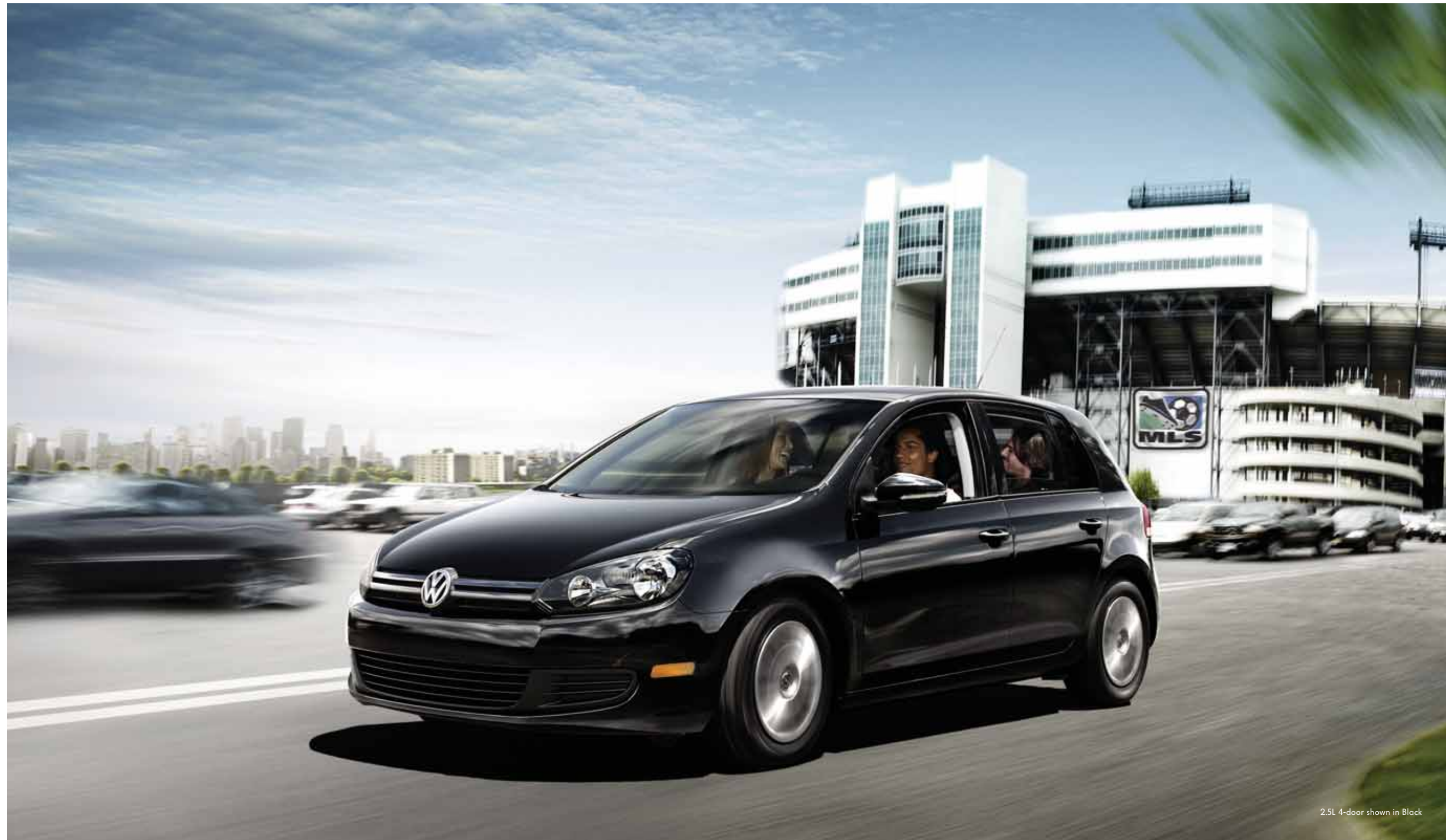
2.5L 4-door shown in Black

It's no small feat for the Golf TDI® Clean Diesel to be named a 2010 "Top 10 Green Car" by Kelley Blue Book's kbb.com.* Especially when it was announced at the New York International Auto Show that the Golf was awarded "World Car of the Year"*** in 2009. The thing is, what matters most is that customers around the world have been making the Golf one of the most popular compact cars for 36 years. And they've kept the Golf TDI in ultra-high demand every year it's been on the market. Don't get us wrong, all those awards are incredibly important and very flattering. But the awards panelists only have the privilege of driving the Golf during the judging process. When you own one, you get to drive it for years. So in the end, the fact that our customers keep coming back for more year after year is what keeps us innovating. Those awards, well, they're just more proof that we're doing something right.