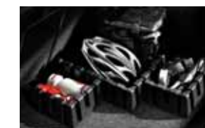
Heavy Duty Trunk Liner with Cargo Organizer Blocks