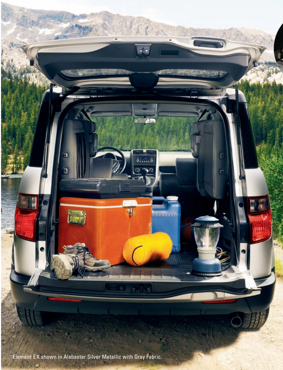
Element EX shown in Alabaster Silver Metallic with Gray Fabric.