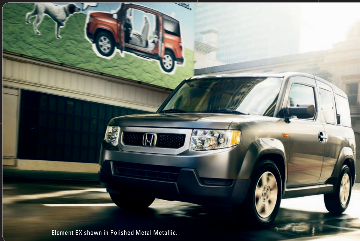
Element EX shown in Polished Metal Metallic.

An efficient 2.4 liter i-VTEC® engine gives the Element its go power. More adventurous drivers can opt for the available Real Time™ 4-wheel drive system, which senses front-wheel slippage and automatically sends power to the rear wheels to keep you on your way (LX, EX).